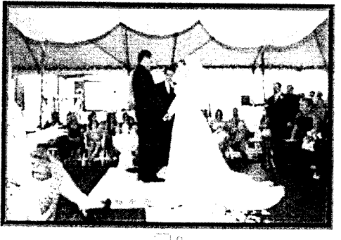
Lighting Overexposure at it's finest!