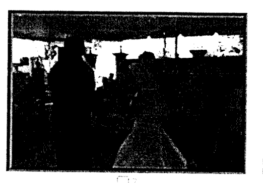
Lighting This could have been a great shot. Too bad we'll never know.