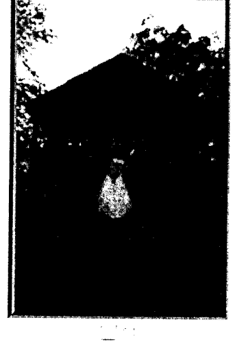
Distance and Lighting There wasn't 1 cloud in the sky<sup>+</sup>

• Log In • About Us • Terms • Privacy • What's New • Support