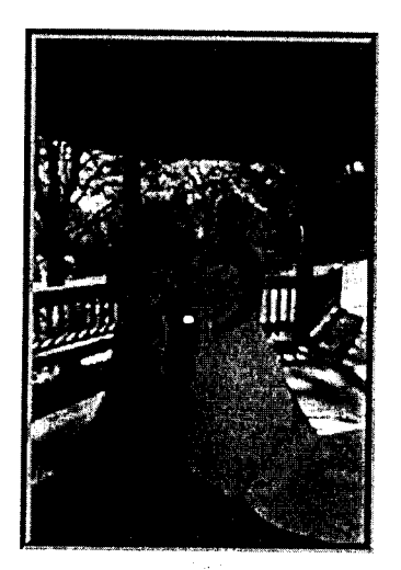
Lighting More flash malfunctions