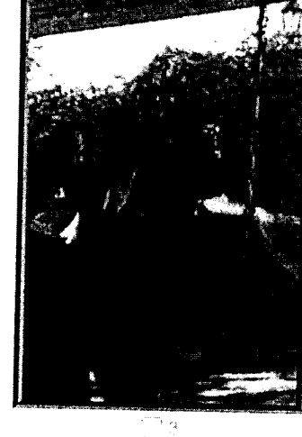
Lighting It would have been nice to see her face