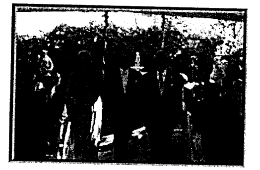
Lighting Another flash malfunction