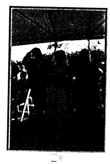
Lighting Since when do you photograph INTO background light with a faulty flash?