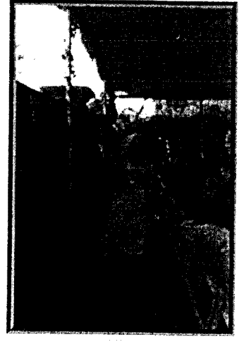
Lighting The picture speaks for itself.